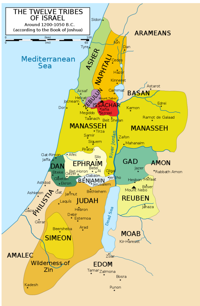
Locations of Manasseh, Asher, Zebulun, Naphtali

2Ch 30:10-12 So the couriers passed from city to city through the country of Ephraim and Manasseh, and as far as Zebulun, but they laughed them to scorn and mocked them. 11 Nevertheless some men of Asher, Manasseh and Zebulun humbled themselves and came to Jerusalem. 12 The hand of God was also on Judah to give them one heart to do what the king and the princes commanded by the word of the LORD.