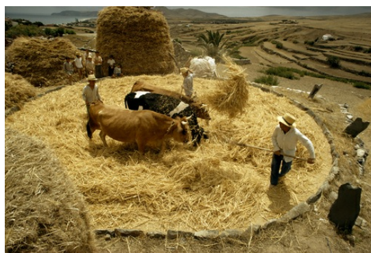
Oxen Threshing Grain Note the Elevated Location